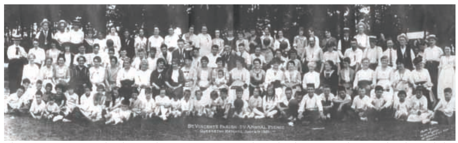
Photo: St. Vincent's Parish, 5th Annual Picnic, Queenston Heights, July 6th, 1921 (See the original in the vestibule)